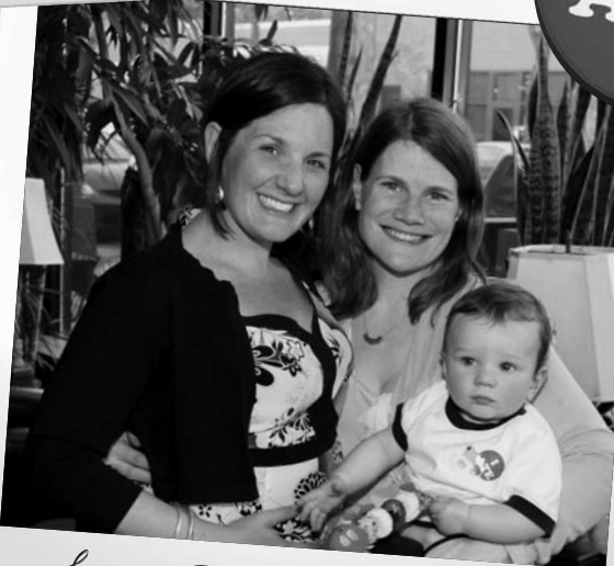
We Dined Out!