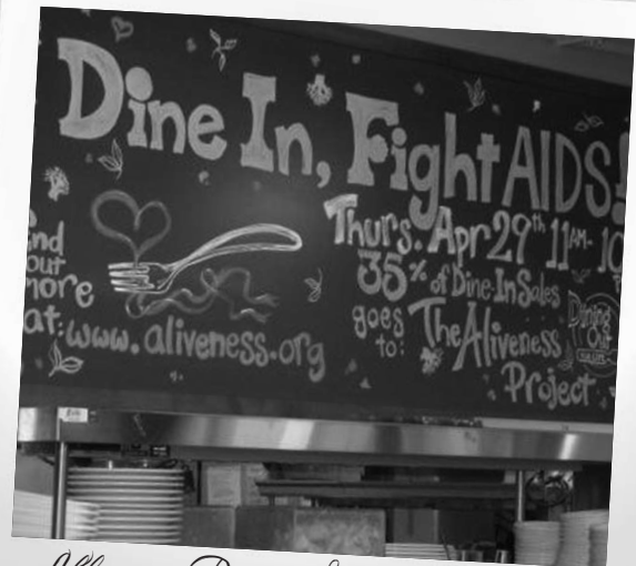
All five Pizza Luces joined in again for Dining Out for Life