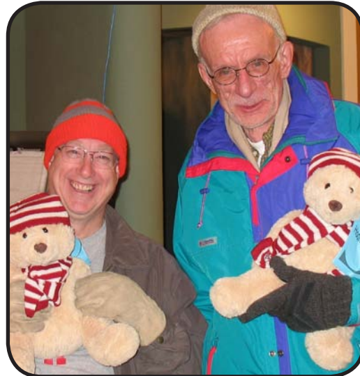
Volunteers take home a teddy for all their volunteer work!